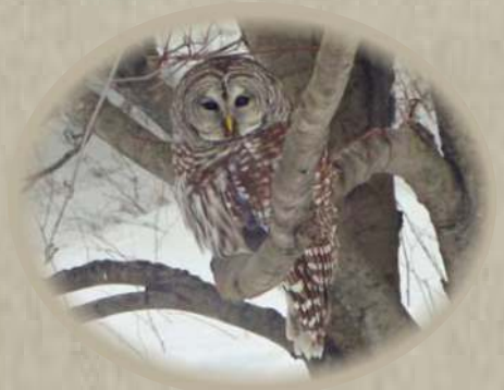
Winter Barred Owl Photo Taken from Garden Bedroom

I have not always been happy with my B&B experiences - bad beds, bad pillows, mediocre food. At Debbie and Alan's it is a different experience. First, the location, and their home, is beautiful. Just what you would want from a serene northwoods adventure. Second, I am not a cook but I do know how to appreciate the very fine food that we were offered. My group of friends enjoyed all Debbie's specialties, snacks and breakfast were generous and delicious. Third, very comfortable beds and great sheets and pillows. Too much info? You can't have too much information when you plan a dreamy retreat! Come and enjoy this northern hospitality. Mary - Watersmeet, MI