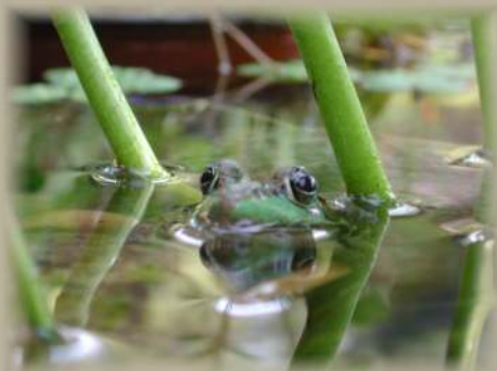
Common Summer Resident