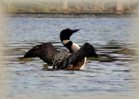
Common Loon Frequent Summer Visitor

Over the years, my husband and I have stayed at many B&B's, and some were so-so while others were absolutely wonderful. The Piel's Forest Gardens Getaway is absolutely wonderful. The accommodations were very comfortable and well-appointed. The view out of every window provides a picture postcard image. Look out the dining room windows and you see the gardens. Look out of the living room and eating nook for views of the private lake. Look out the kitchen and behold! An amazing screened gazebo. Unfortunately, I was there in the winter, but that didn't stop my imagination. I could imagine sitting out there with other guests, sipping on a glass of wine at the end of the day. Alan and Debbie are gracious hosts, and Debbie has the cutest giggle I've ever heard. The food Debbie prepared was what you would expect an "absolutely wonderful" B&B would provide. All in all, I am hoping to get back to Forest Gardens Getaway at some time in the future. The peace and quiet are a balm for my soul. Margaret - Land O' Lakes, WI