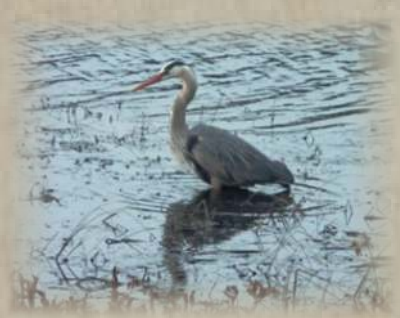
Great Blue Heron Common Summer Resident